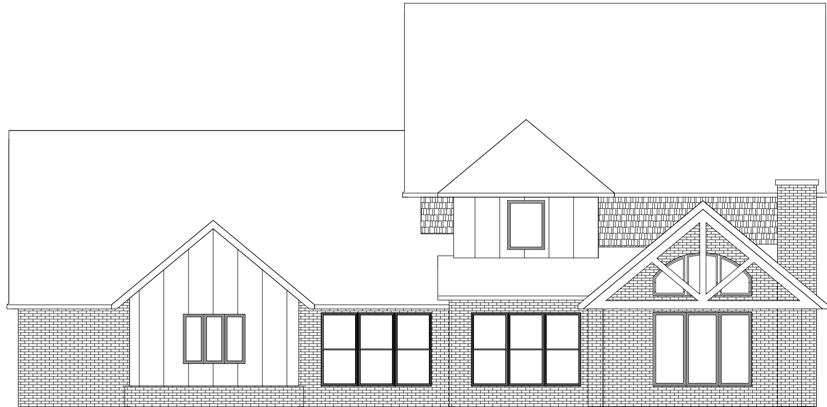
② BACK ELEVATION FLYER 1/8" = 1'-0"