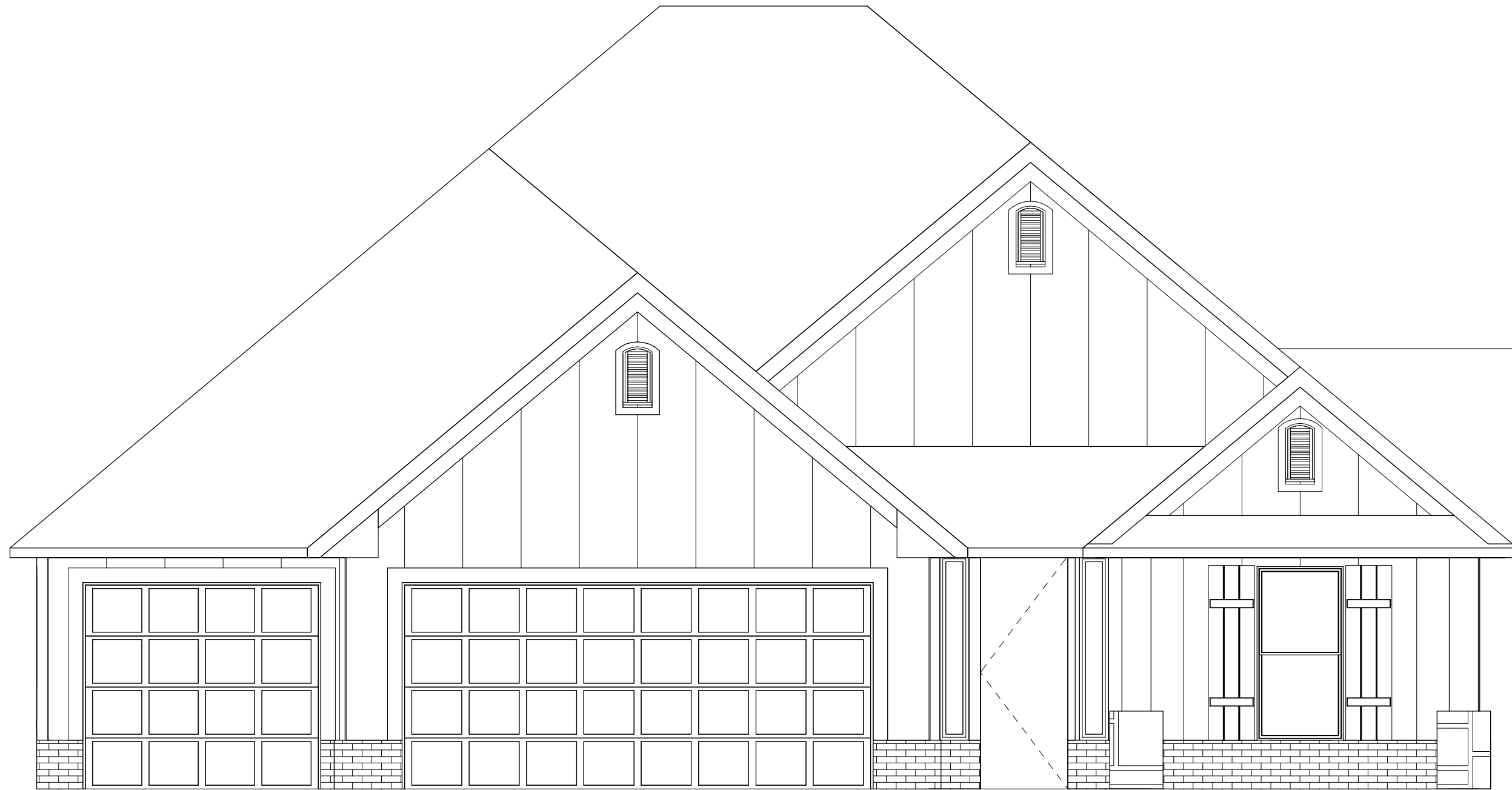
1 FRONT ELEVATION - Flyer 1/4" = 1'-0"